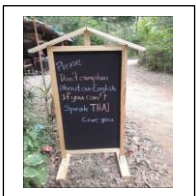
Thais are always willing to help with the language; I don't like seeing such as this.