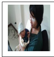
My Thai Tutor with her baby just home from the hospital after a premature birth earlier in 2019. Thank you all for praying! He's doing well & has adjusted to being home.